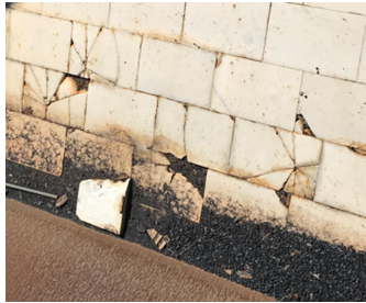
#1- 21/07/2023 11:13:22 AM