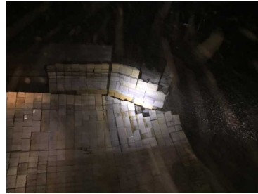
#2- Liners missing at bottom 21/07/2023 10:55:13 AM