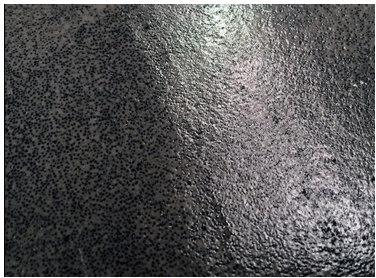
Type: Visual, Date: 11/10/2022<br>Caption: Wear Resist.png