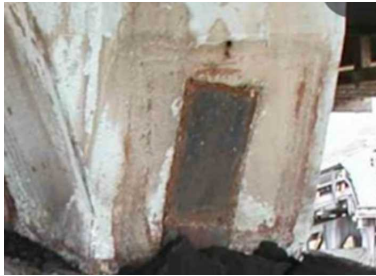
Type: Visual, Date: 11/10/2022<br>Caption: Chute.png